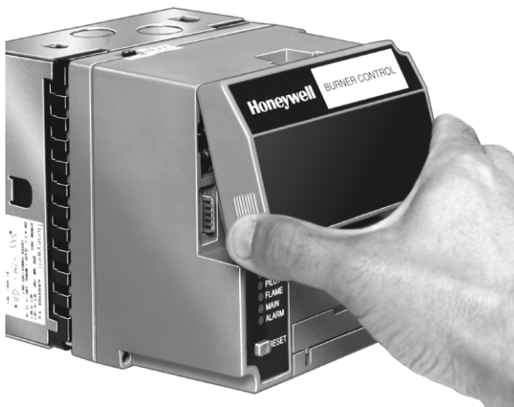
Fig. 2. Mounting Remote Reset Module.

The S7820A Remote Reset Module mounts directly on the Relay Module.